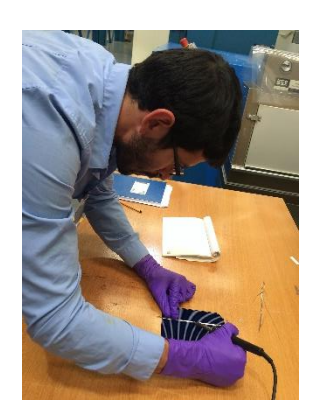
Soldering of a solar cell metallization

Current polymeric materials in backsheets and encapsulants of PV modules have a strong resistance towards degradation which is good for the manufacturers and PV module reliability, but the timeframes for material testing and characterization are short. Still, plenty of outcomes and results can be taken from the stability and ageing behaviour even if they do not show the expected degradation modes. During my time as MSCA fellow I have learned for material ageing research is that time is a key factor. A good experimental planning is needed to make the best out of it, and collaborative work is a must.